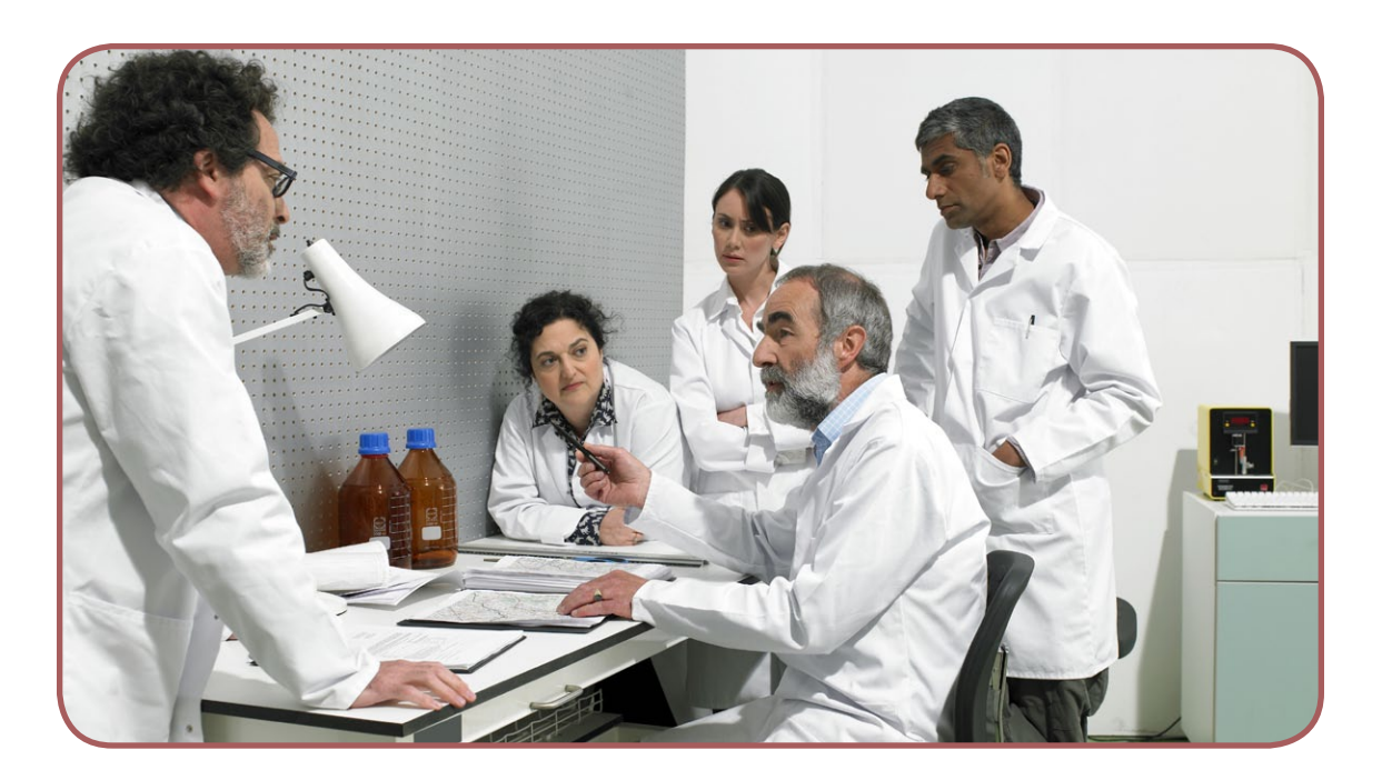
Technical ability is essential to STEM work, but communication skills are also important.

says. "Creativity can help you come up with a solution no else could."